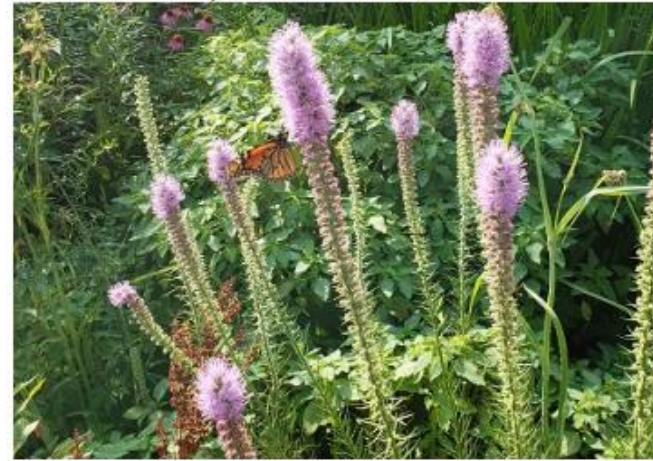
1,000 Rain Garden Goal