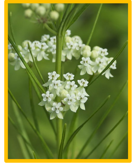
Whorled milkweed ( Asclepias verticillata )