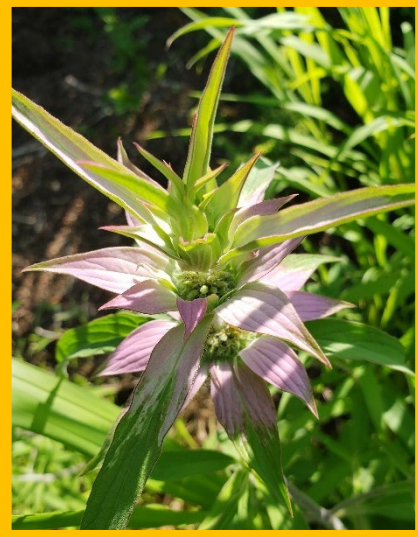
Spotted bee-balm ( Monarda punctata )