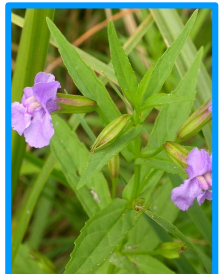
Monkey flower ( Mimulus ringens )