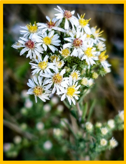
Heath aster ( Symphotricum ericoides )