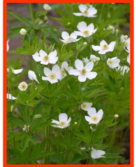
Canada anemone ( Anemone canadensis )