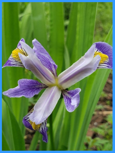
Northern blue flag iris ( Iris versicolor )

Features forbs no taller than three feet, ideal for those looking to avoid vision hazards.