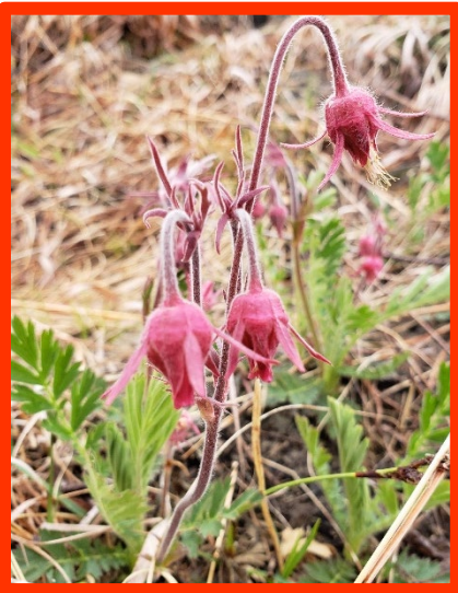
Prairie smoke ( Geum triflorum )