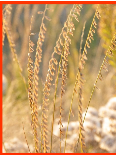
Side oats grama ( Bouteloua curtipendula )