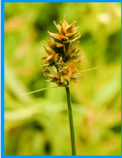
Plains oval sedge ( Carex brevior )