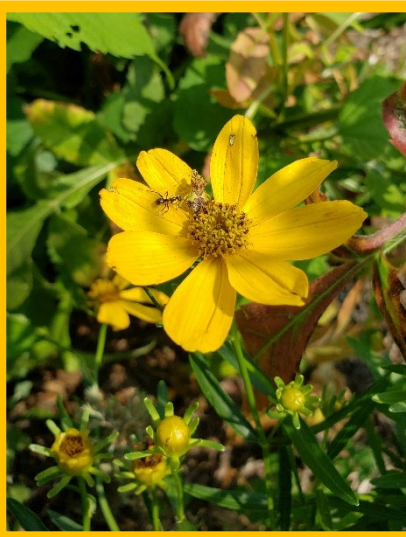
Prairie coreopsis ( Coreopsis palmata )