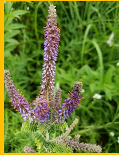
Leadplant ( Amorpha canescens )