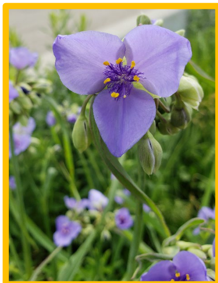
Spiderwort ( Tradescantia ohioensis )