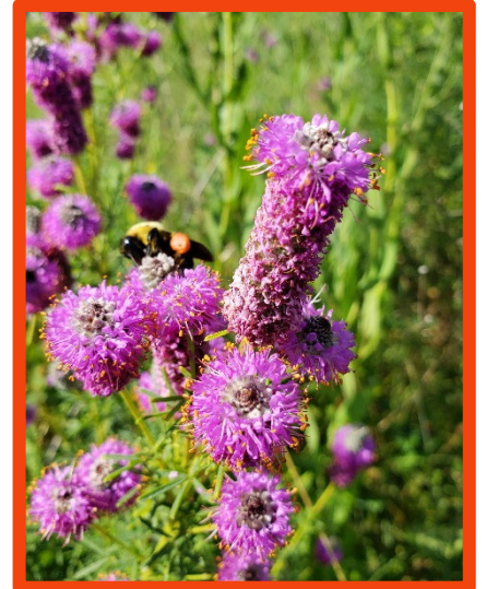
Purple prairie clover ( Dalea purpurea )