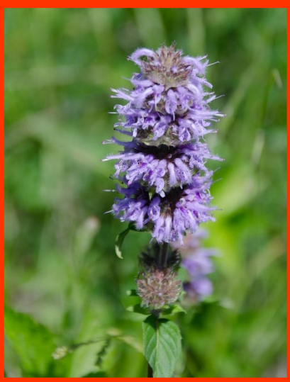
Downy wood mint ( Blephilia ciliata )