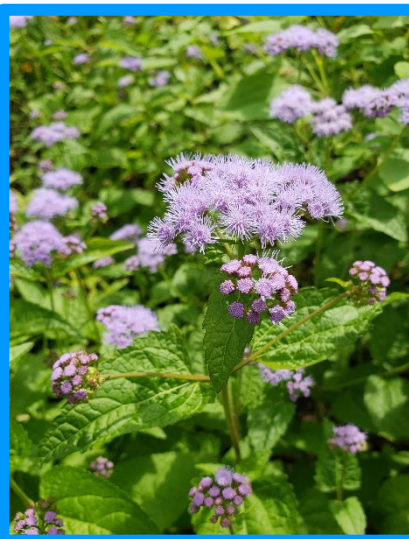
Mistflower ( Eupatorium coelestinum )