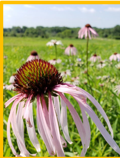
Pale purple coneflower ( Echinacea pallida )