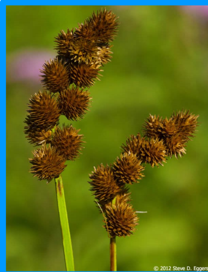
Crested oval sedge ( Carex cristatella )