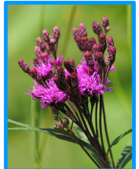
Ironweed ( Vernonia fasciculata )