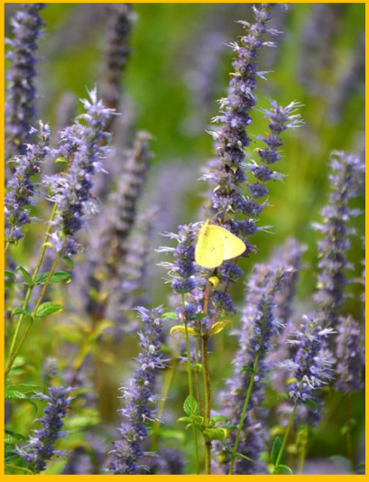
Lavender hyssop ( Agastache foeniculum )

Lavender or lilac, plum or periwinkle. Whatever you call it, Jimi would be proud.