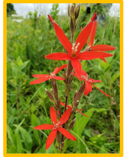
Royal catchfly ( Silene regia )