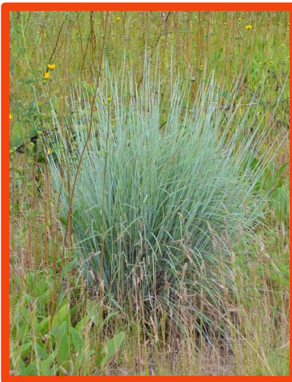
Little bluestem ( Schizachyrium scoparium )