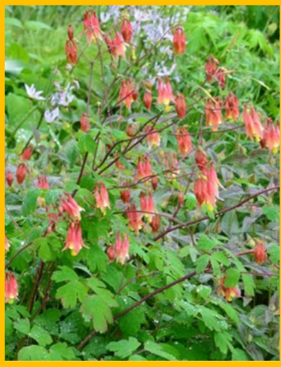
Columbine ( Aquilegia canadensis )

This eye-catcher contains only the most vibrant and vivacious of plants.