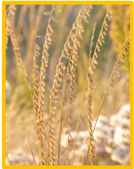
Side oats grama ( Bouteloua curtipendula )