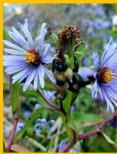
Sky blue aster ( Symphyotrichum oolentangiense )