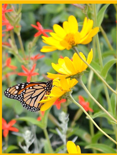
Early sunflower ( Heliopsis helianthoides )