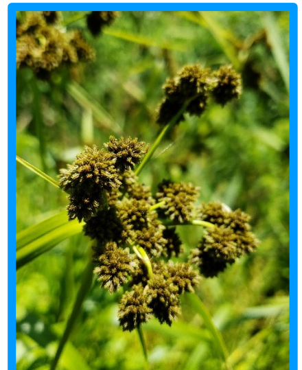
Dark green bulrush ( Scirpus atrovirens )