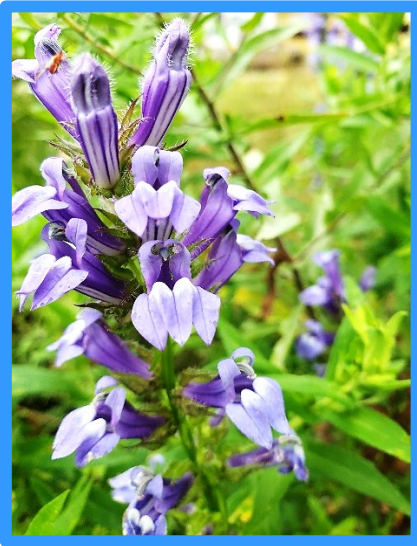
Great blue lobelia ( Lobelia siphilitica )