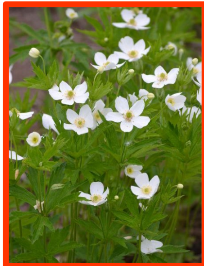
Canada anemone ( Anemone canadensis )