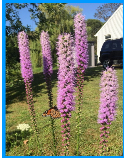
Prairie blazing star ( Liatris pycnostachya )