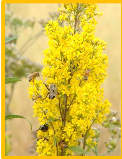
Showy goldenrod ( Solidago speciosa )