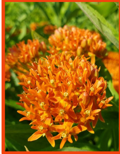
Butterfly milkweed ( Asclepias tuberosa )