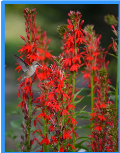
Cardinal flower ( Lobelia cardinalis )