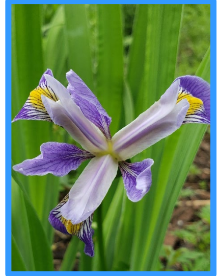
Northern blue flag iris ( Iris versicolor )