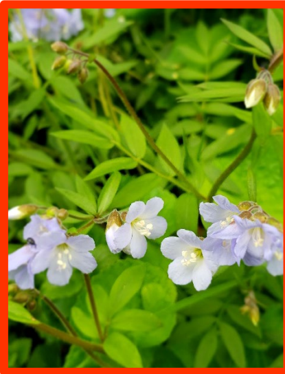
Jacob's ladder ( Polemonium reptans )