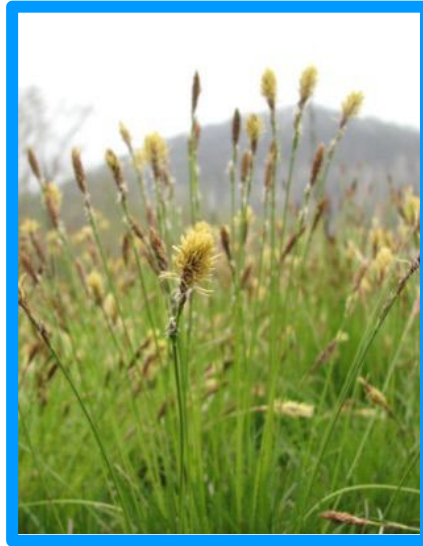
Common oak sedge ( Carex pensylvanica )