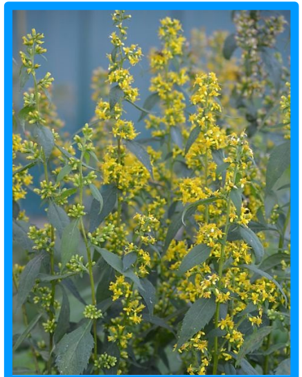
Zig zag goldenrod ( Solidago flexicalus )