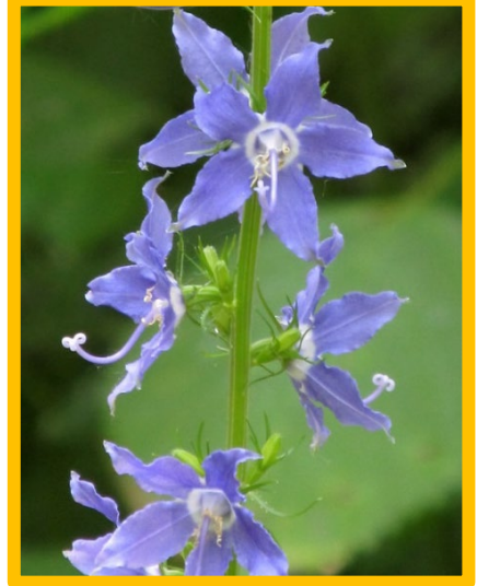
Tall bellflower ( Campanula americana )