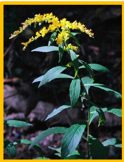
Elm-leaved goldenrod ( Solidago ulmifolia )