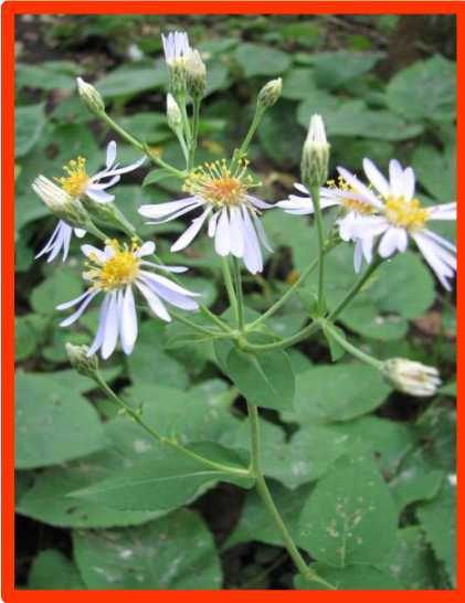
Big-leaved aster ( Eurybia macrophylla )