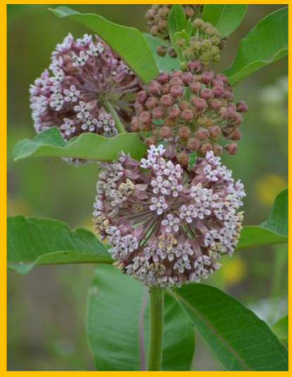
Common milkweed ( Asclepias syriaca )

No sun? No stress. These plants aren't afraid of the dark.