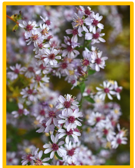
Heart-leaved aster ( Symphyotricum cordifolium )