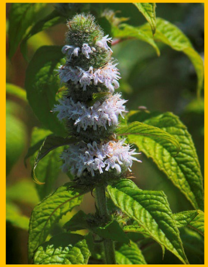
Hairy wood mint ( Blephilia hirsuta )