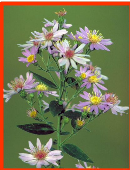
Short's aster ( Symphyotricum shortii )