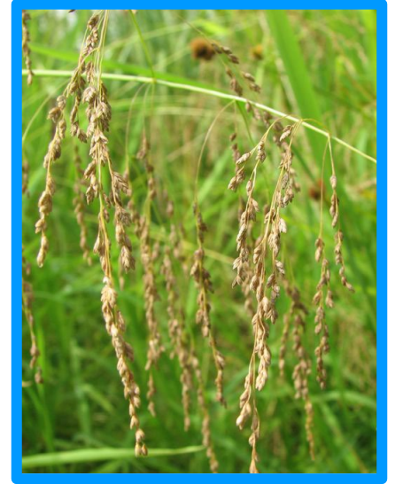
Fowl manna grass ( Glyceria striata )