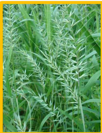
Bottlebrush grass ( Elymus hystrix )